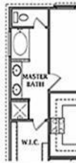
OPT. MASTER LUXURY BATH