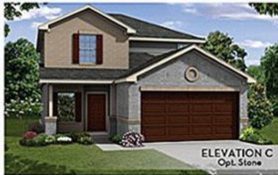
ELEVATION C Opt. Stone