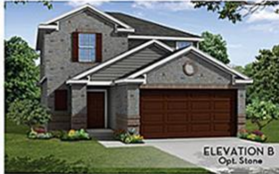
ELEVATION B Opt. Stone