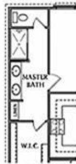
OPT. MASTER BATH SHOWER