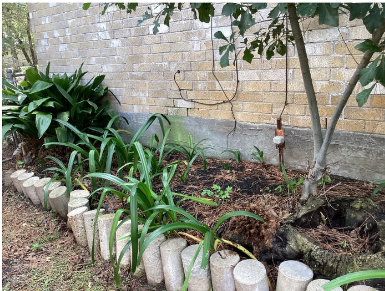
Foundation exposure at front, for reference. No cracking noted at the foundation at any location.