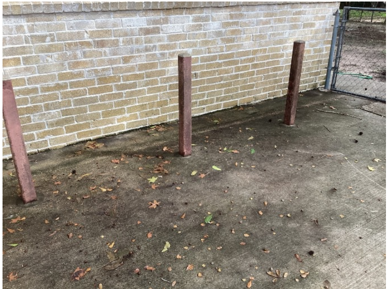
At the right side of the home, a driveway has been poured against the home with a negative slope. This driveway is in place above the bottom run of the brick and is obstructing some weep holes along the rear section.