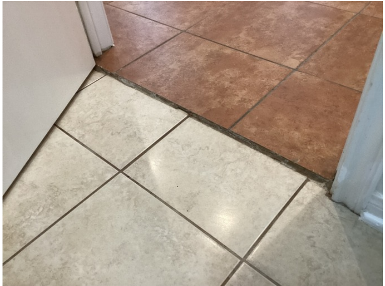
Threshold between kitchen (1st addition/white) and 2nd addition (red). Approximately .5" variation between the two flooring types.