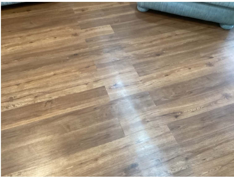
Hump noted between initial foundation and 1st addition. Appears to be larger than it is due to light and flooring layout. Hump appears to be at its maximum .5". 1st addition section appears to be slightly raised from original slab.