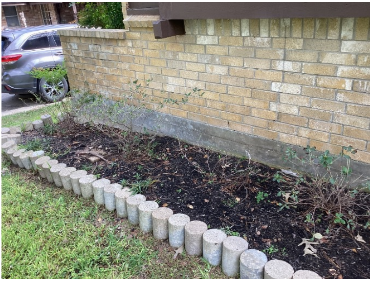
Foundation exposure at front left, for reference.