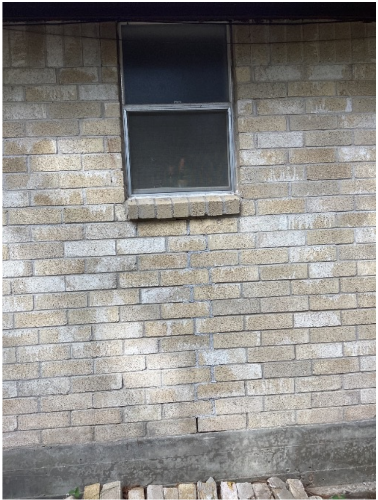
Mortar cracking from hallway bath window to foundation, left side of the home.