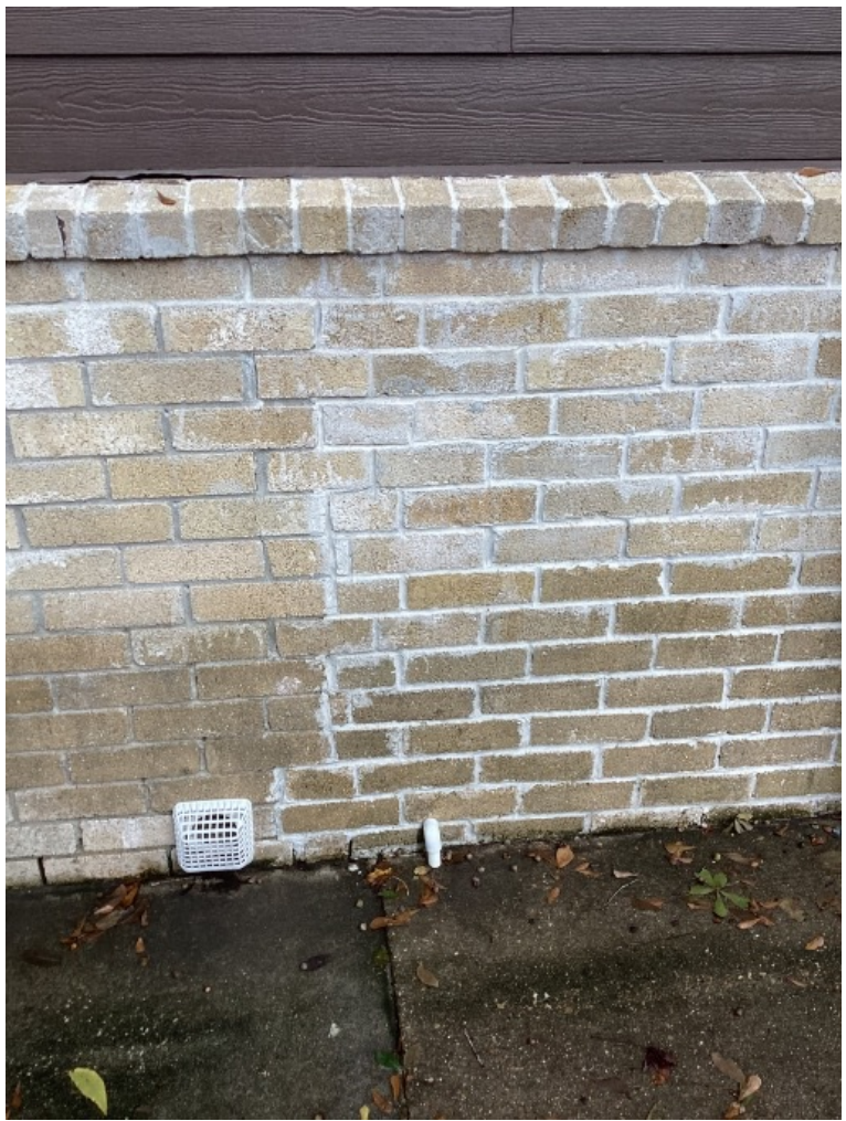
Junction between the garage and the 2nd addition brick facade along the right side of the home.