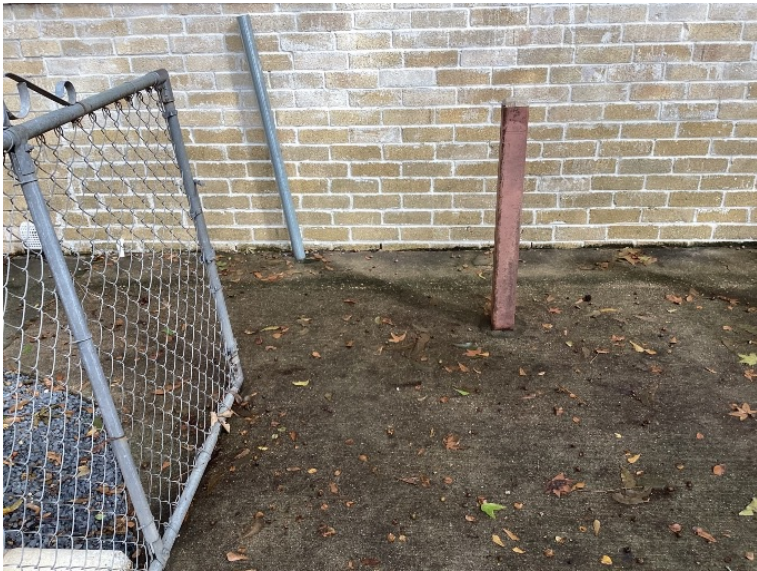
At the right side of the home, a driveway has been poured against the home with a negative slope. This driveway is in place above the bottom run of the brick and is obstructing some weep holes along the rear section.