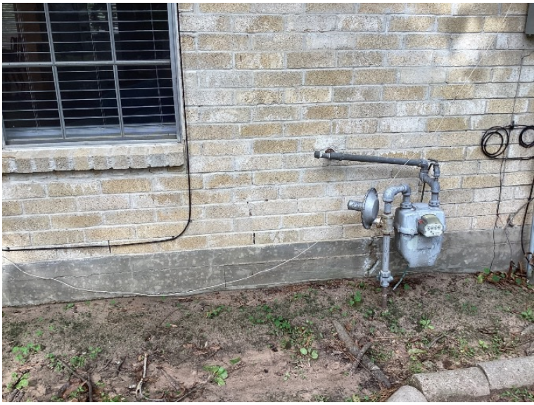
Stairstep cracking from window to gas meter, rear left of home.