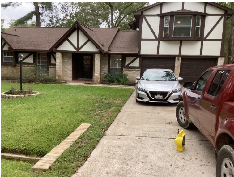
Front of the home.