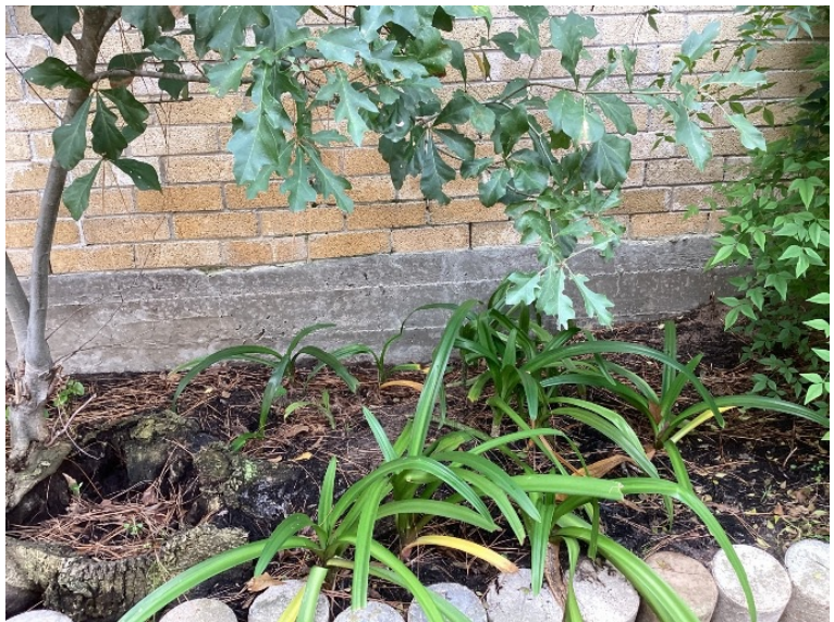
Foundation exposure at front, for reference. No cracking noted at the foundation at any location.