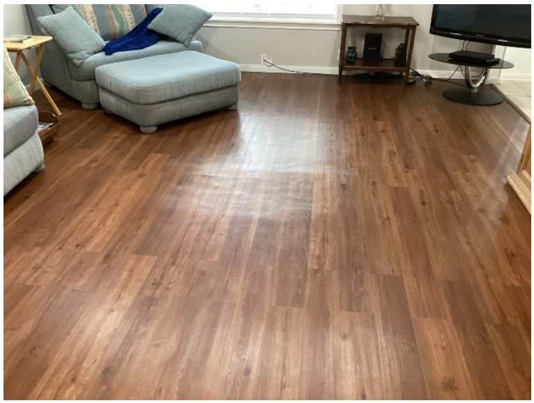
Hump and 1st addition section as seen from living room, facing rear.