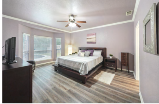
The FIRST FLOOR, HUGE primary bedroom features easy to maintain luxury vinyl plank floors, a large bay window, crown molding, a spa-like ensuite bath, and designer color scheme.