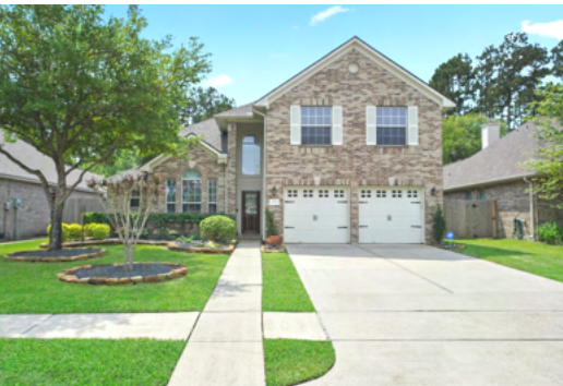
The front elevation features a brick facade, mature landscaping with black star granite, double wide driveway, and two car garage.