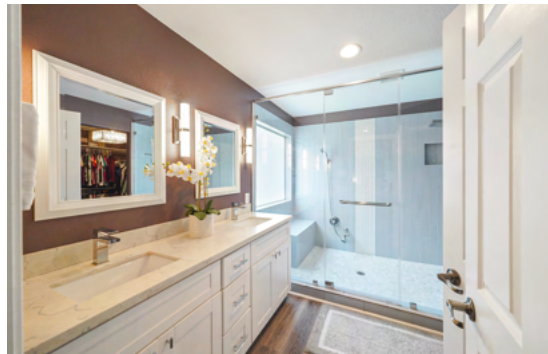
We just love this spa-like bath with an updated walk-in shower with dual shower heads, one of which is a rainhead, a designer color scheme, updated hardware and fixtures, and quartz