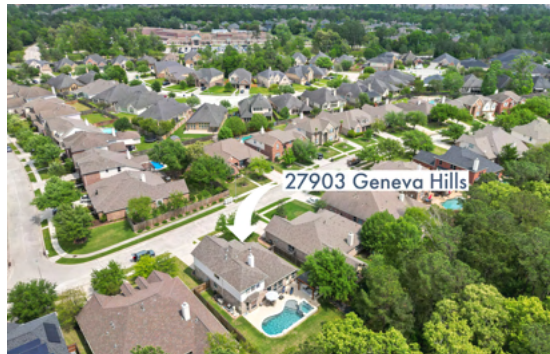
As if this house needs more! The Spring Hills community also offers walking trails, playgrounds, and tennis courts.