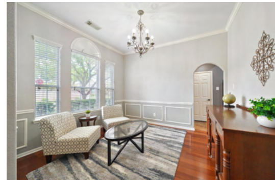
Upon entry to your right is the formal living room which features wood floors, chandelier, large windows allowing loads of natural light, and crown molding.