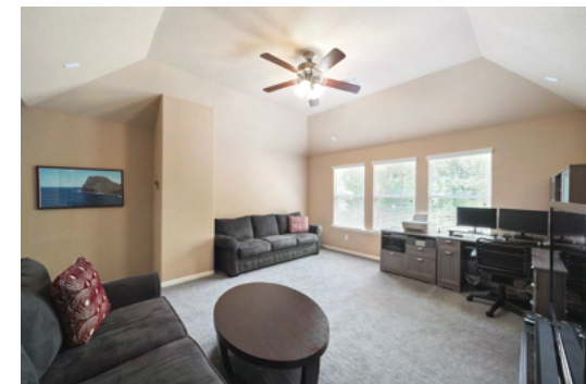
The upstairs flexspace offers lush carpet, large windows and loads of space.