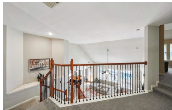
From this view, you can see how open and airy the space is.