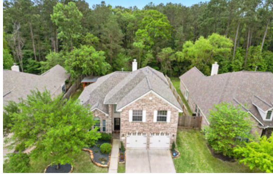
Wow! Surrounded by beautiful lush foliage, soaring trees, and mature landscaping, this 4/2.1 with a POOL backs up to a greenbelt that will NEVER be built on. Luxury and Privacy galore!