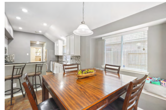
The breakfast room is picture perfect with its picture window.