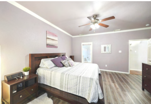
The door on your left leads to a large ensuite bath with a walk-in closet, and the door to your right leads to the living room.