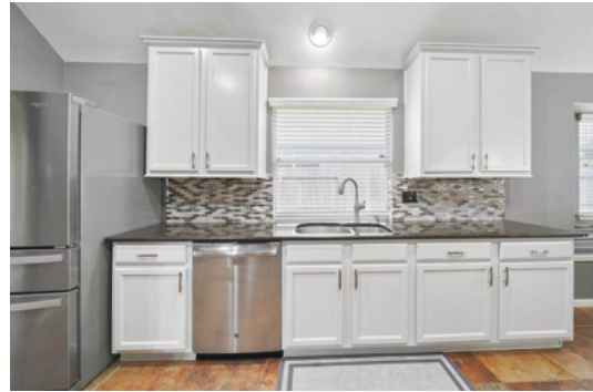
We just love this spa-like bath with an updated walk-in shower with dual shower heads, one of which is a rainhead, a designer color scheme, updated hardware and fixtures, and quartz countertops.