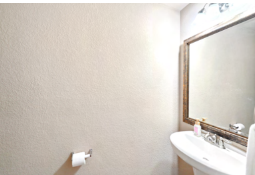
The first floor features a convenient half bath for guests.