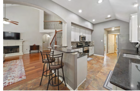
The kitchen is a chef's dream with granite counters, recessed lights, designer backsplash, gas range, SS appliances, large pantry, and breakfast bar.