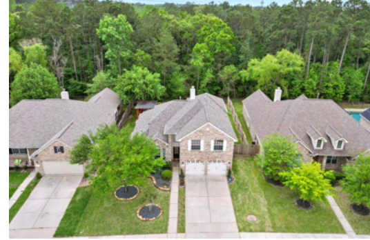
This 2 car garage features epoxied garage floors and heavy duty raised shelving.