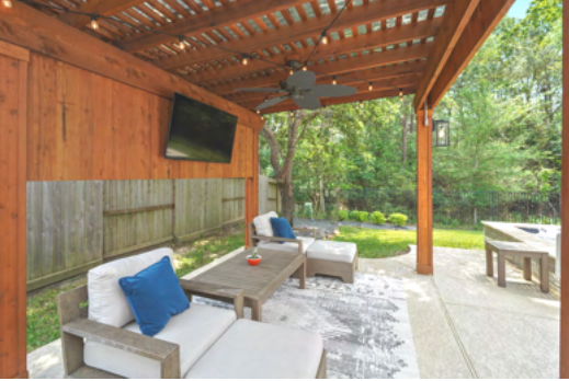
Welcome home to 27903 Geneva Hills. This gorgeous home is MOVE-IN READY perfection!