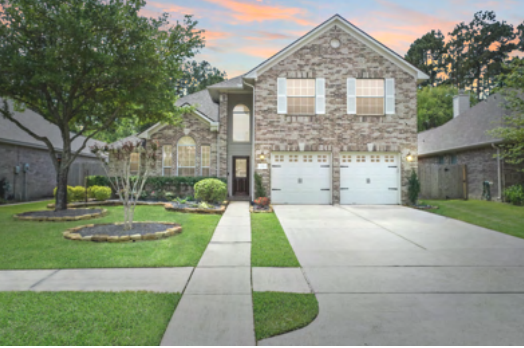
Welcome home to 27903 Geneva Hills. This gorgeous home is MOVE-IN READY perfection!