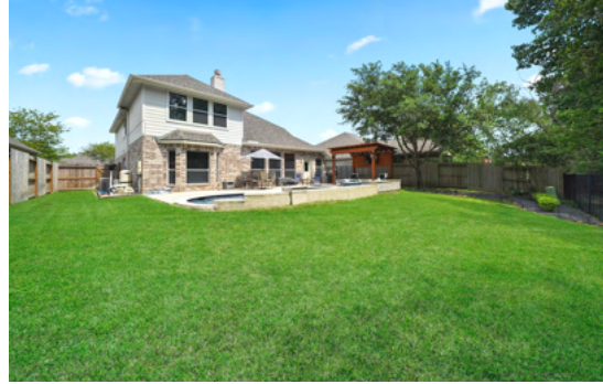
There's also still so much yard left!