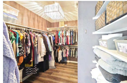
Walk-in closet with beautiful chandelier.