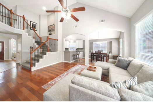
The living room offers a wood burning fireplace with gas connections with a stone facade and large windows. From this angle you can see into the breakfast area and kitchen through the chic archways.