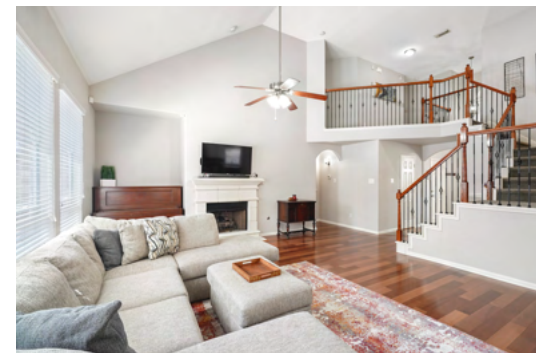
The two story open concept living area is opened up to the second floor, allowing for an airy space with large windows that engulf it with light.