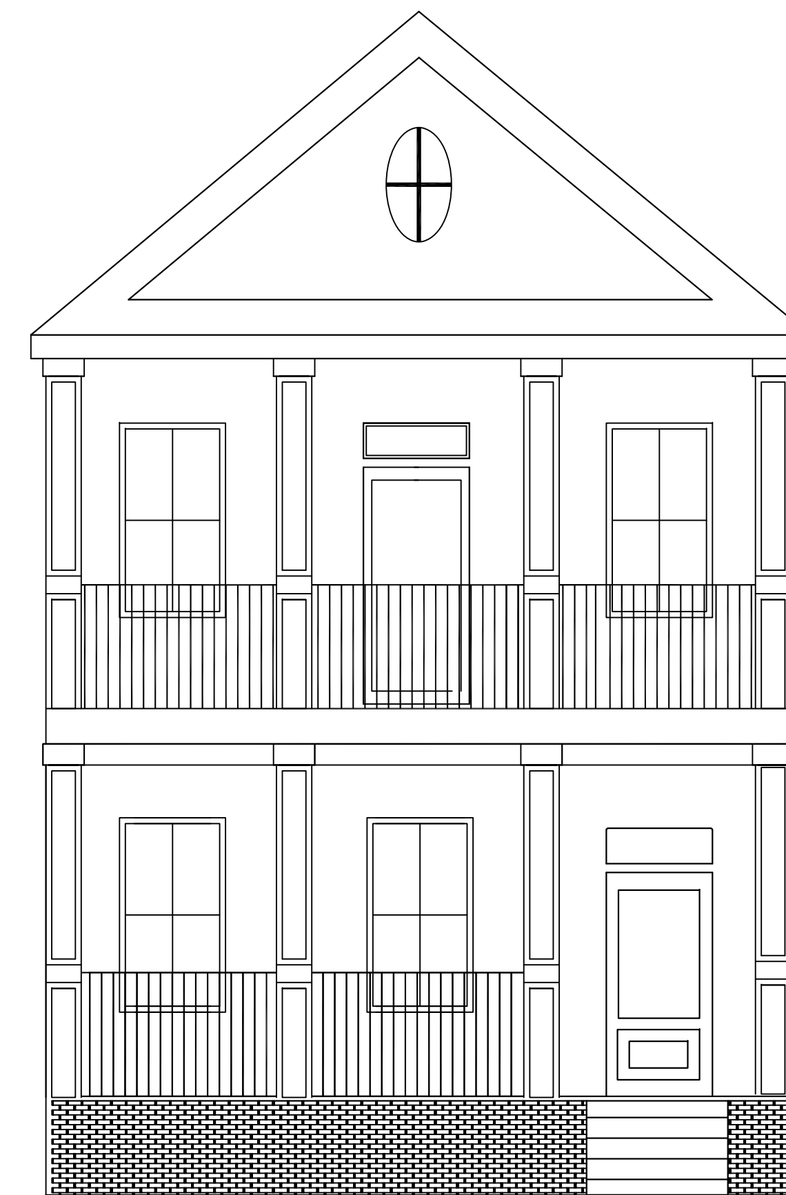
FRONT ELEVATION (EAST)