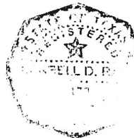
EXHIBIT " A "