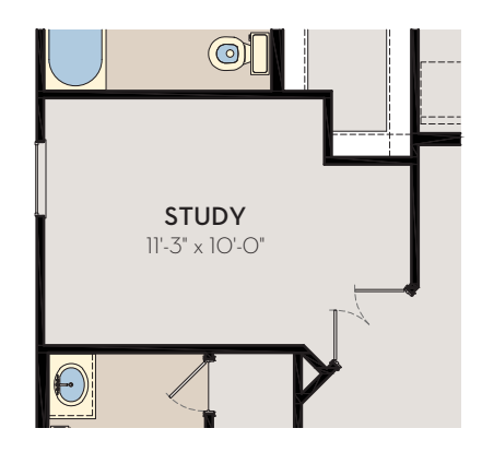
OPT. STUDY IN LIEU OF BEDROOM #3