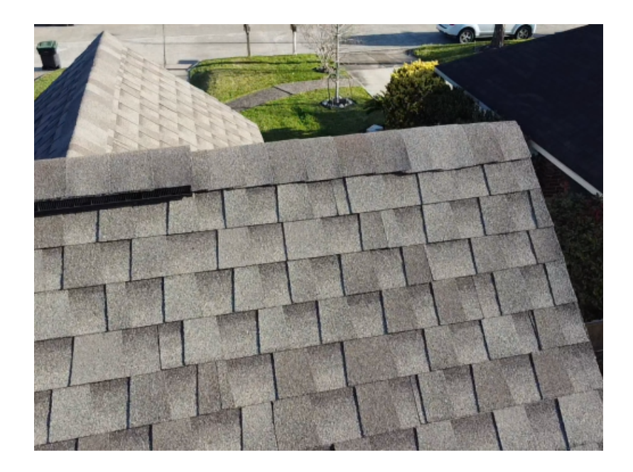
Ridge cap and vent are present and installed properly