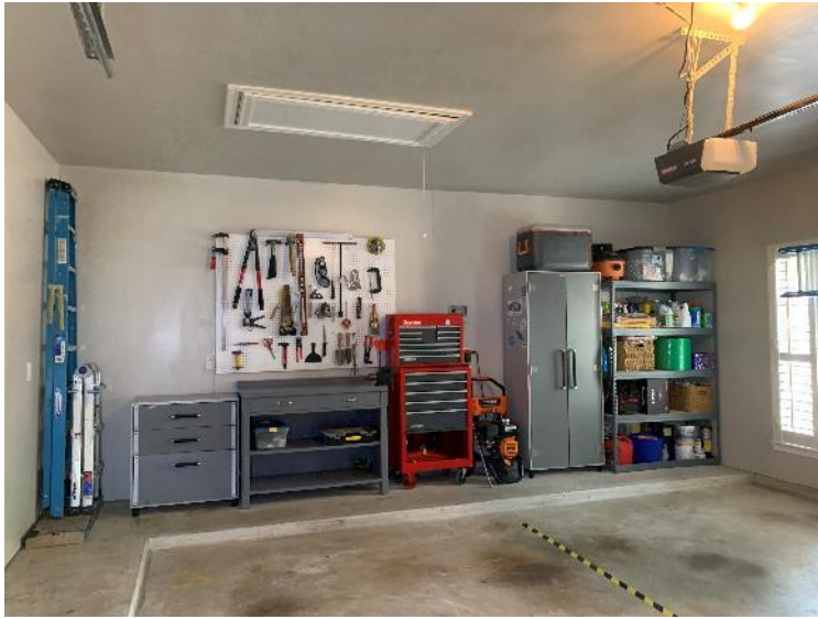
Items stored in garage obstructing view