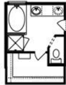
STANDARD MASTER BATH