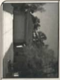
NOTE: THIS IS SUBJECT TO ANY MONTGOMERY COUNTY OR MONTGOMERY COUNTY RECORDS RELATIVE TO THIS PROPERTY.

OF NO. FTH-11-77H1001676 FIDELITY NATIONAL TITLE ADDRESS: 11703 WILLOWRUN DRIVE MONTGOMERY, TEXAS 77356 BORROWER: DAVID H. BADE AND LINDA BADE LOTS 14 & 28, BLOCK 7 WALDEN ON LAKE CONDO. SECTION 2 ACCORDING TO THE MAP OR PLAT THEREOF RECORDED CABINET A, SHEET 62A (PROPERTY) CABINET 10, SHEET 10 OF THE MAP RECORDS OF MONTGOMERY COUNTY, TEXAS