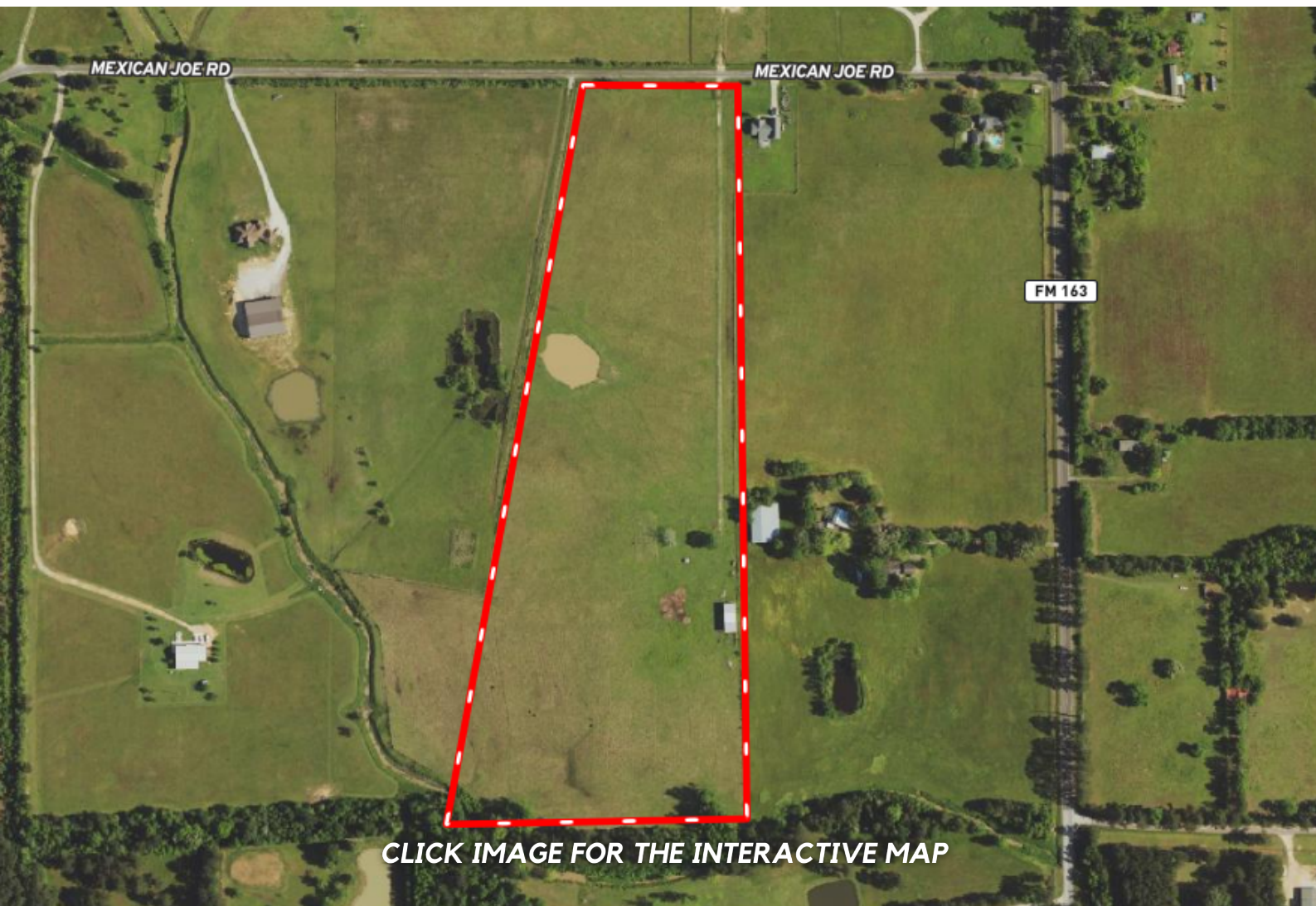
CLICK IMAGE FOR THE INTERACTIVE MAP