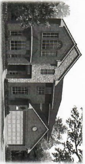
ELEVATION B WITH OPTIONAL STONE