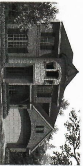
ELEVATION E ✓