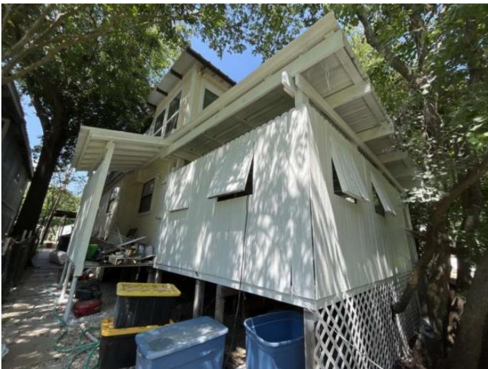
Rear & Side View