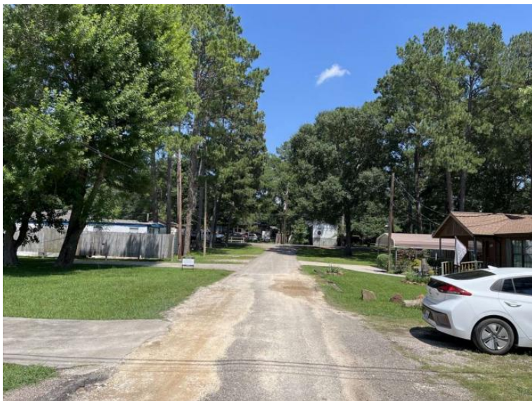
Subject Street View