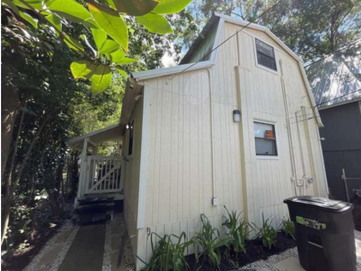
Front & Side View