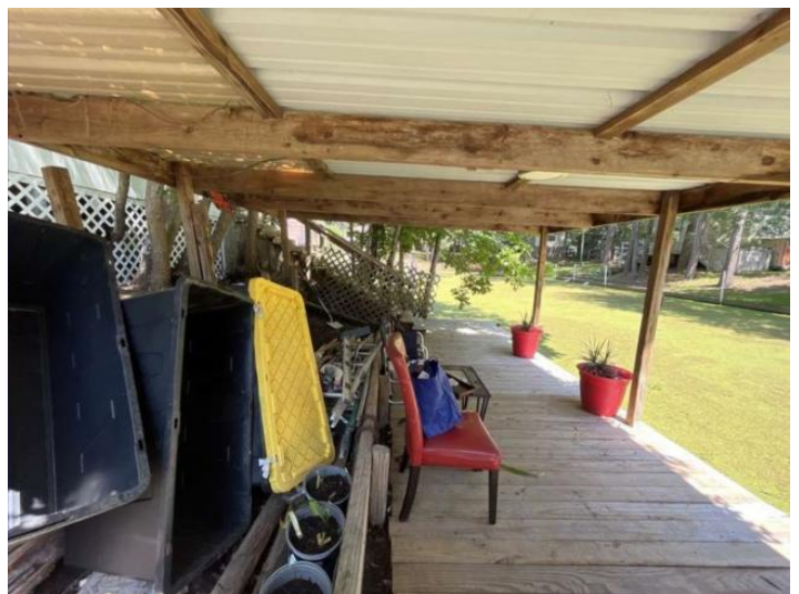
Cover Wood Deck