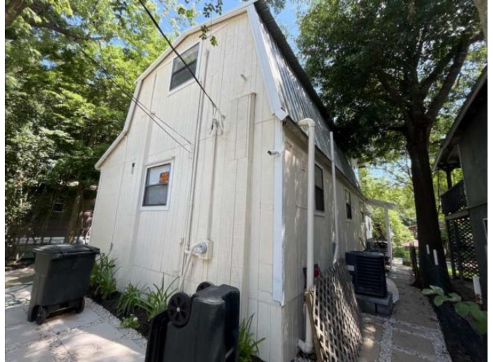
Front & Side View