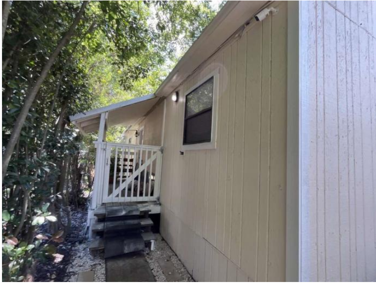
Subject Property Front