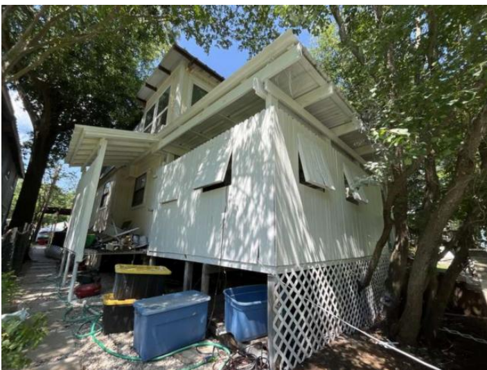
Rear & Side View