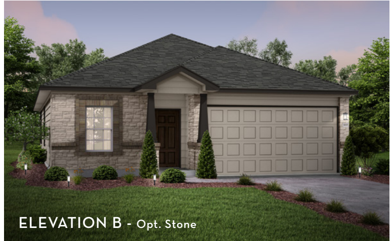
ELEVATION B - Opt. Stone