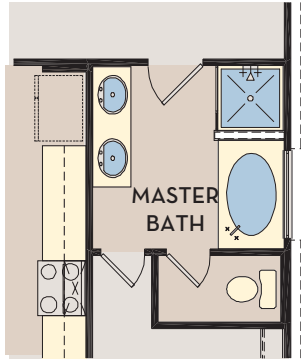
OPT. MASTER LUXURY BATH