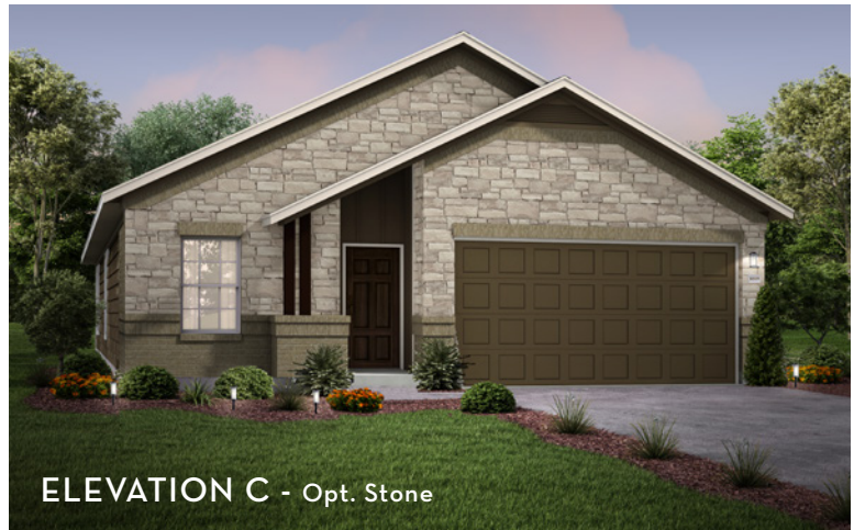
ELEVATION C - Opt. Stone