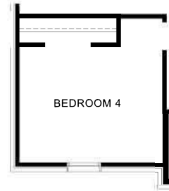
Optional Bedroom 4