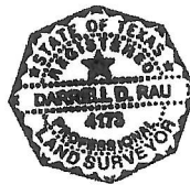
Exhibit "A" page 1 of 2