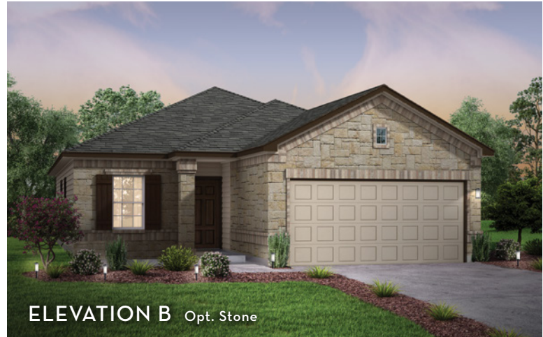
ELEVATION B Opt. Stone