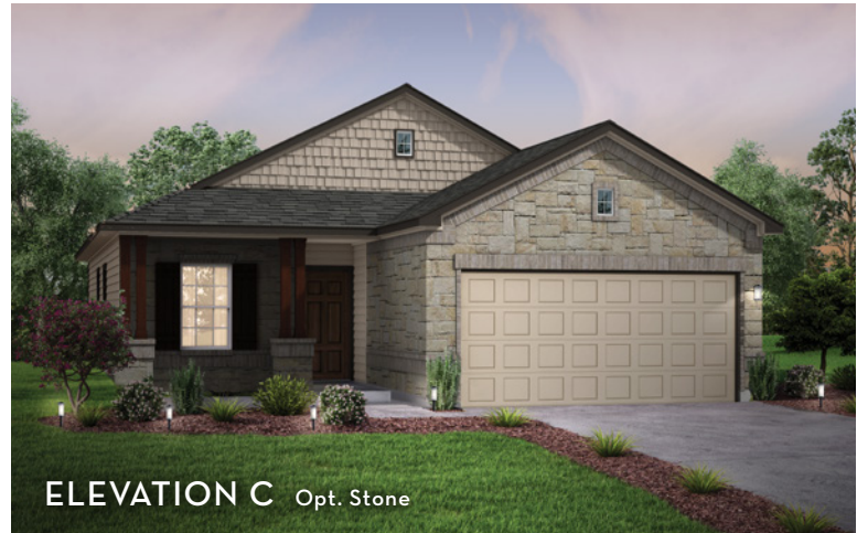
ELEVATION C Opt. Stone