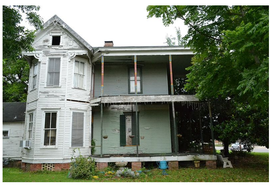
25or6to4, CC BY-SA 3.0, via Wikimedia Commons