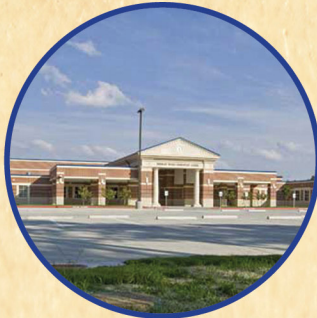
BIRNHAM WOODS ELEMENTARY

Amber Forest From the $370s David Weekley Homes Village Builders