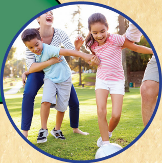
SENOVA RIDGE PARK