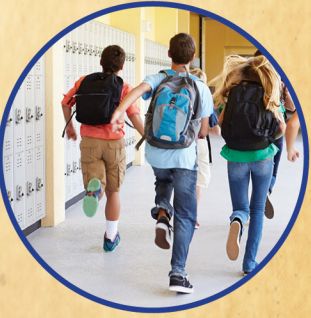
CLARK INTERMEDIATE SCHOOL TO OPEN 2018