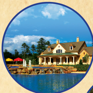
THE LAKE CLUB