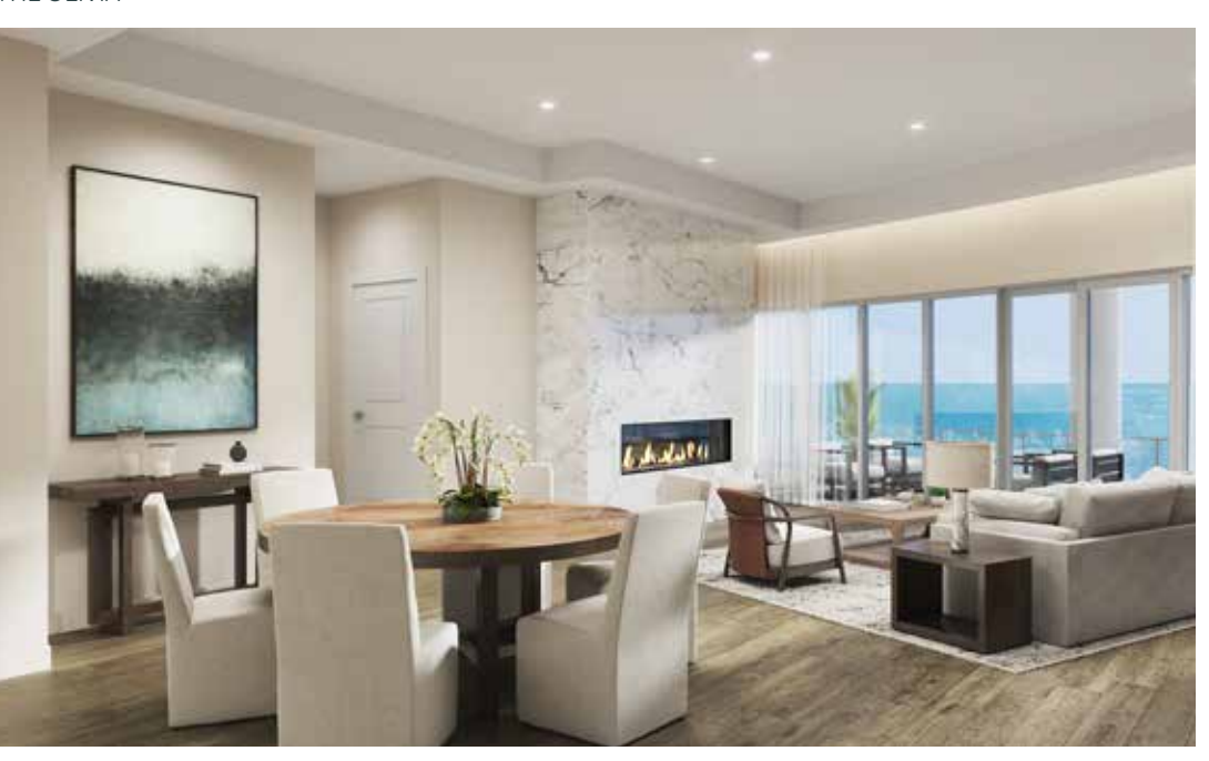
THE MARIA PENTHOUSE

Ease into waterfront living at Tiara on the Beach, where Galveston's treasured destinations are minutes from your front door, and in your backyard lies the sparkling water and sands of the Gulf. Nurture your senses. Gather by the fire, chill in the infinity pool, or lounge under the sun. Your new home on Galveston Beach has never looked so good.