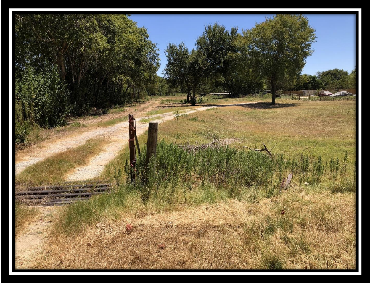
76.474 Acres Clay Street Brazos County, Texas