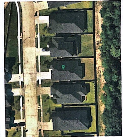
SATELLITE AERIAL PHOTO