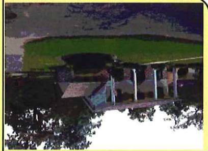
NOTE: RIGHT OF WAY TO GROGEN MANUFACTURING CO. PER VOL. 88, PG. 503.

D.C.L. = DIRECTIONAL CONTROL LINE RECORD BEARING: VOL. 8, PG. 79, L.C.M.R. DRAWN BY: MM A SUBSURFACE INVESTIGATION WAS BEYOND THE SCOPE OF THIS SURVEY DETERMINATION WITHOUT DETAILED FIELD STUDY. BASED ONLY ON VISUAL EXAMINATION OF MAPS, INACCURACIES OF FEMA MAPS PREVENT EXACT ZONE X MAP REVISION: 05/02/2008 PANEL NO. 48291C 0275 C 100 YEAR FLOOD PLAIN AS PER FIRM THIS PROPERTY DOES NOT LIE WITHIN THE