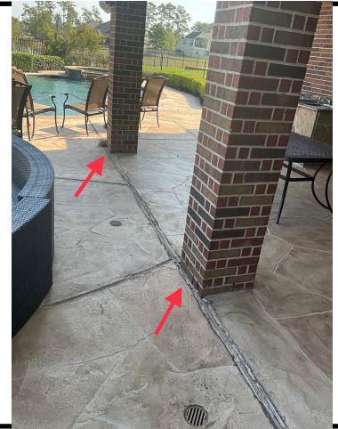
Can not see foundation around columns