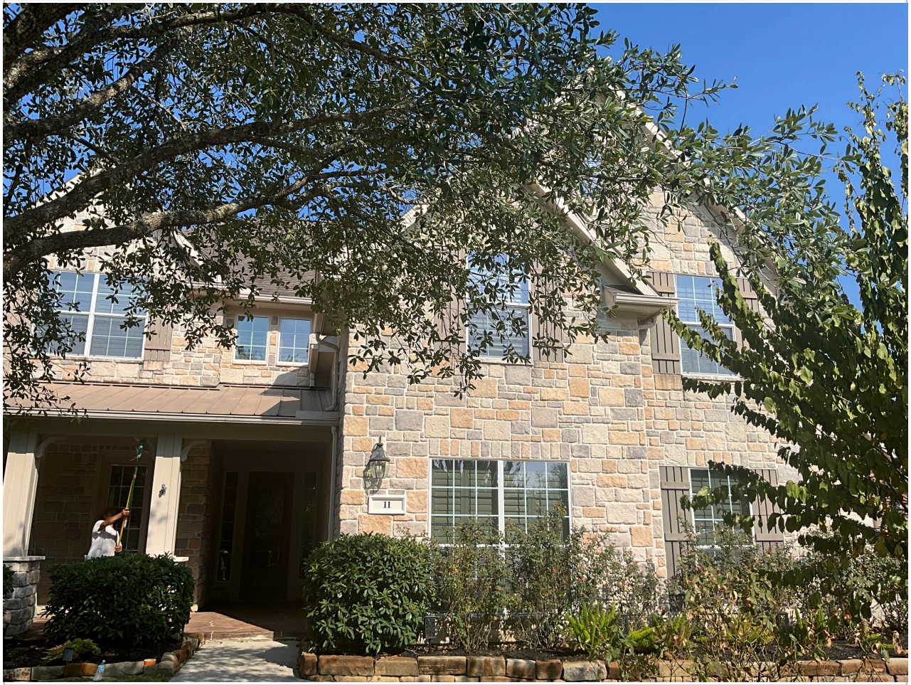
11 Cayuga Pond Court