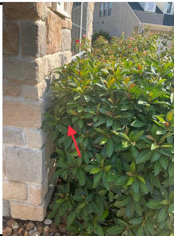
Cut bushes away from home. Rule of thumb is we want to walk between house and bushes