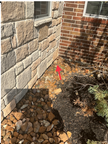
Can not see foundation Move rocks away from foundation