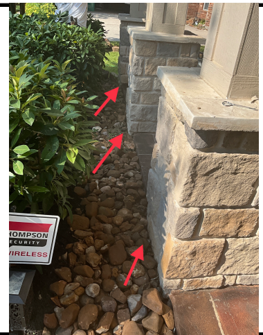
Pull rocks away from columns to see foundation