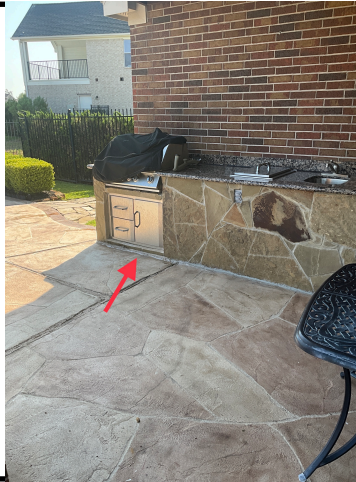
Can not see foundation behind fire pit