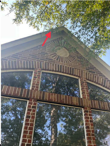
Cut tree limbs away from home.