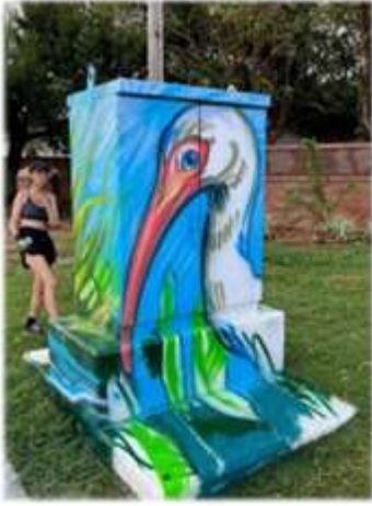
The Newest Painted Boxes On League City Pkwy