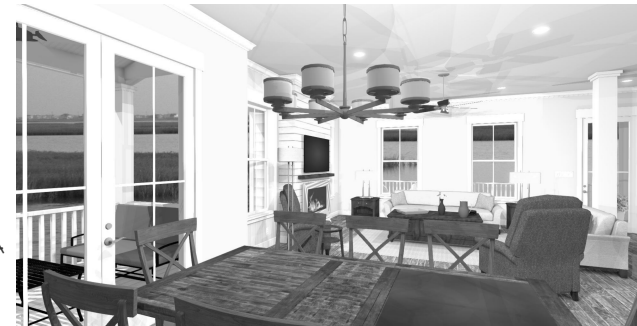
DINING / LIVING

Sht. 1 FILE: OCEAN WALK_IL_2250 A_SZ.plan