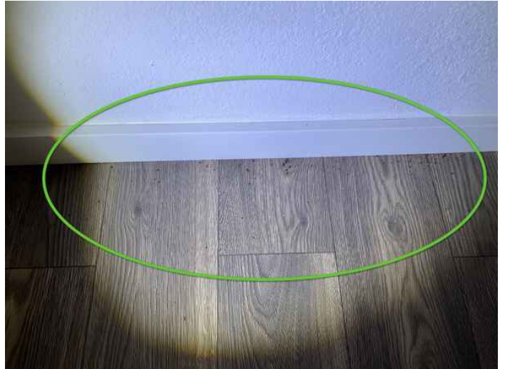
Rear wall at Bedroom 3