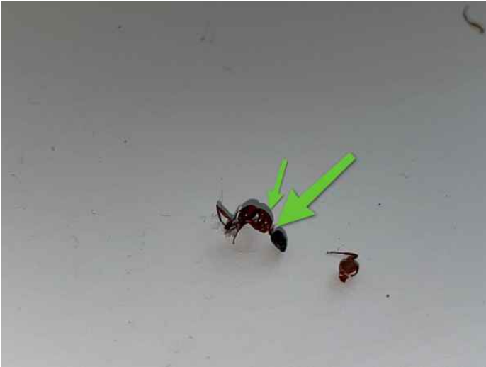
Carpenter ants identified, rounded thorax and raised node behind thorax