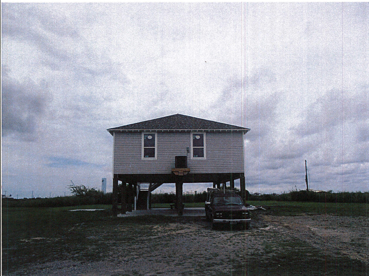
Looking From South