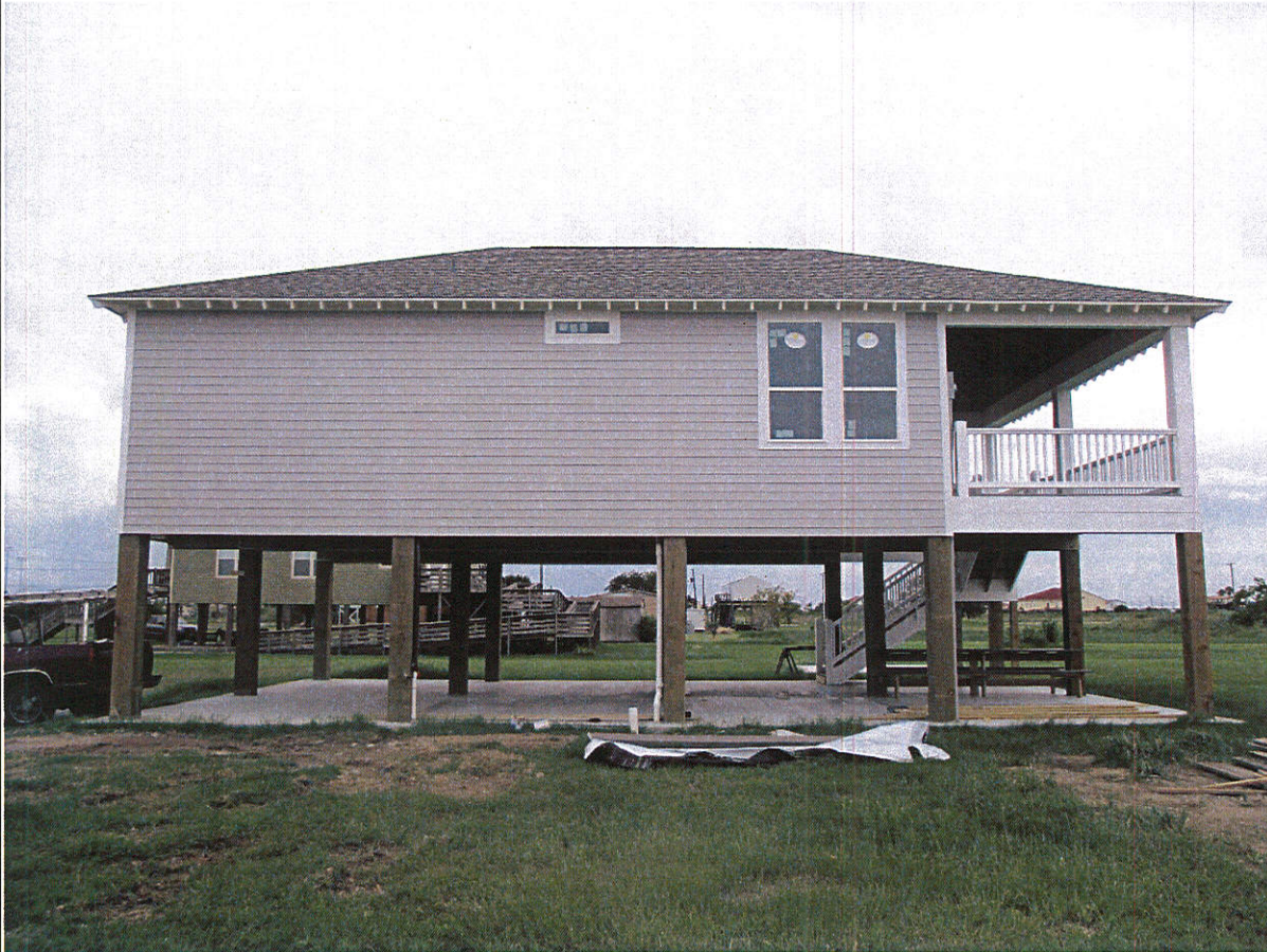
Looking From East

If submitting more photographs than will fit on the preceding page, affix the additional photographs below. Identify all photographs with: date taken; "Front View" and "Rear View" and, if required, "Right Side View" and "Left Side View." When applicable, photographs must show the foundation with representative examples of the flood openings or vents, as indicated in Section A8.