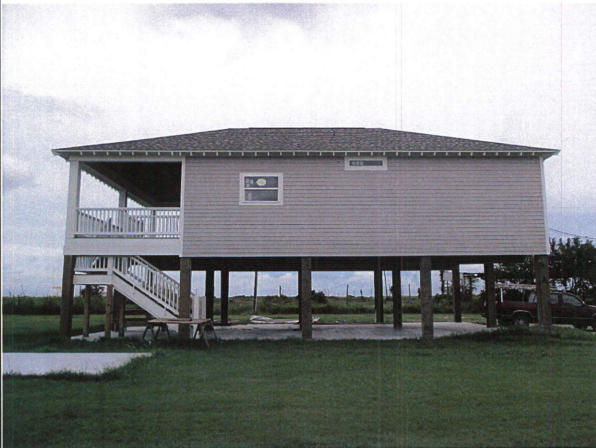
Looking From West