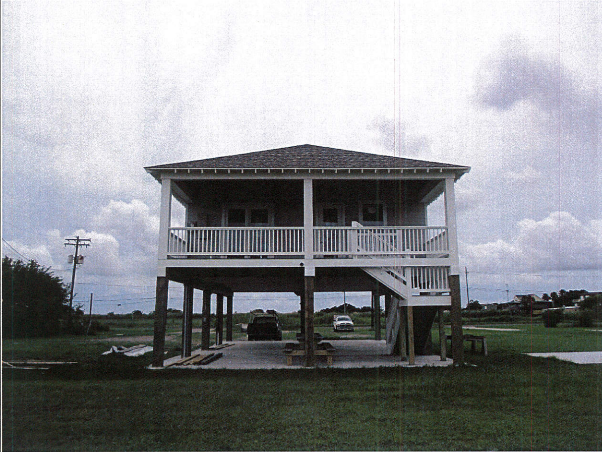
Looking From North

If using the Elevation Certificate to obtain NFIP flood insurance, affix at least 2 building photographs below according to the instructions for Item A6. Identify all photographs with date taken; "Front view" and "Rear view"; and, if required, "Right Side View" and "Left Side View." When applicable, photographs must show the foundation with representative examples of the flood openings or vents, as indicated in Section A8. If submitting more photographs than will fit on this page, use the Continuation Page.