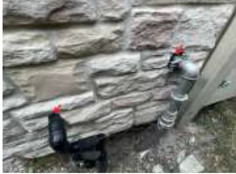
Penetrations lack sealant