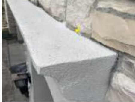
Surface Fixtures lack sealant