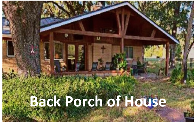
Back Porch of House