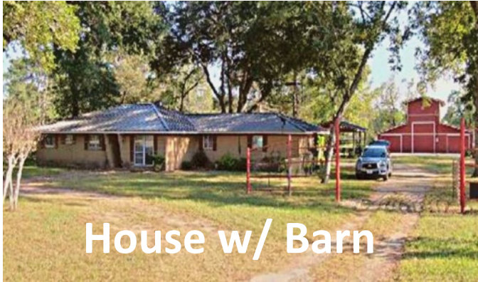
House w/ Barn