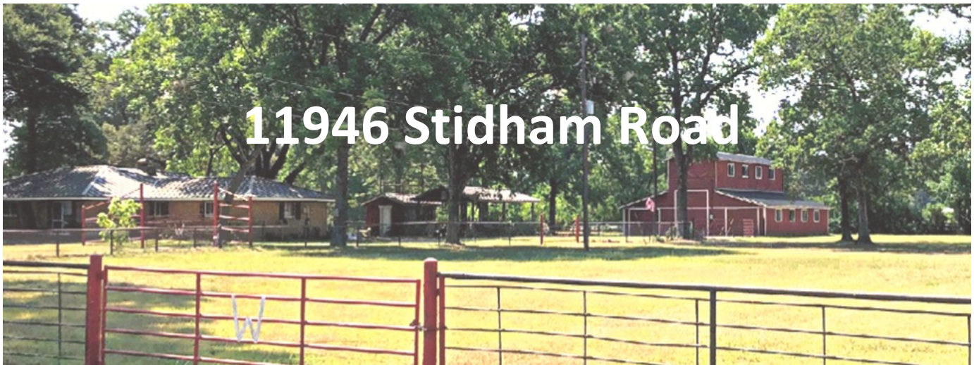
11946 Stidham Road

Sean Smith (281) 466-2880 ext. 3 Sean@foldetta.com