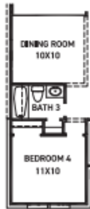
OPT. BEDROOM 4 W/ BATH 3 @ LIVING