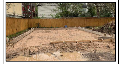
1535 RUTLAND DRIVE

THIS PROPERTY IS NOT IN THE 100 YEAR FLOOD ZONE.