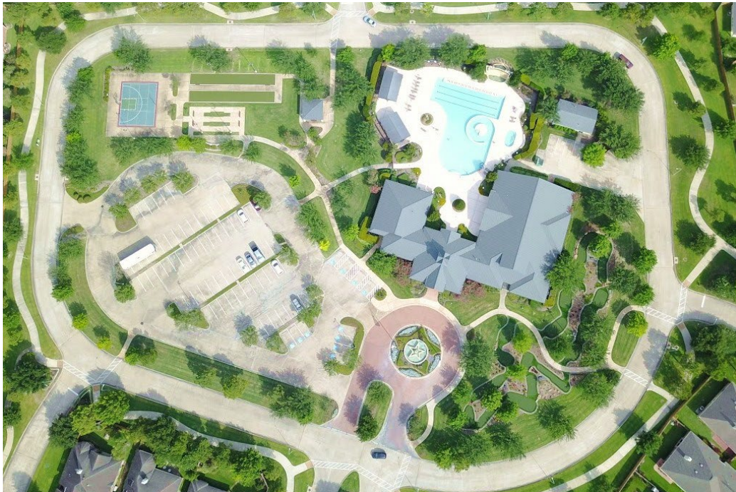
Aerial view of Heritage Circle enclosing common property of Heritage Grand

A monthly HOA assessment fee is required. Please refer to the attached table for the assessment fee amount and a summary of amenities provided by the fee.