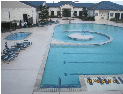
Heated swimming pool

fitness center at the clubhouse is available 24/7.