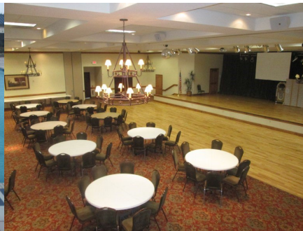
ballroom and stage