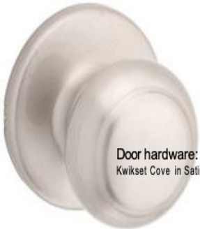
Door hardware: Kwikset Cove in Satin Nickel