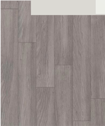
Flooring: Shaw Highlands II Shadow Grey (1 st floor and 2 nd floor wet areas) Shaw Carpet, Graceful Finesse Whisper