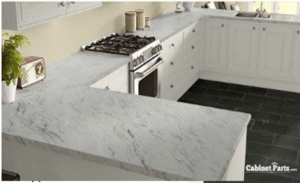
Countertops: Wilsonart Calcutta Marble Laminate