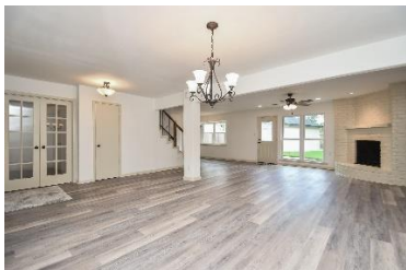
The main living area