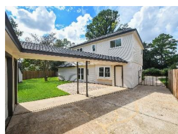
The breezeway from garage to the house