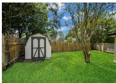
The back yard and shed