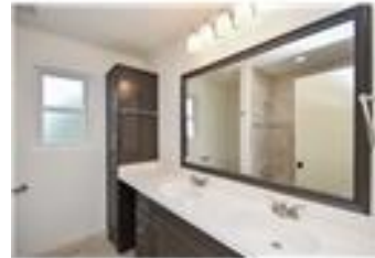
The upstairs bathroom