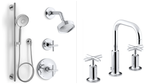
Kohler Numista faucets in chrome in all upper secondary bathrooms