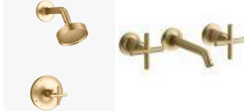
Powder Bathroom: Kohler Purist in Modern Brushed Brass