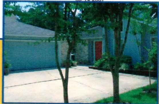
3623 Rolling Forest Drive Soring, Texas 77388

Lot 56, Block 36, CYPRESSWOOD, SECTION 8, CORRECTION PLAT, according to map or plat thereof recorded in Volume 282, Page 70, of the Map Records of Harris County, Texas.