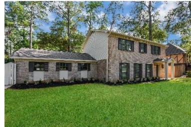
6319 Craigway Rd