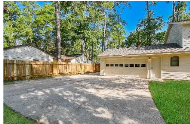
Driveway and Garage