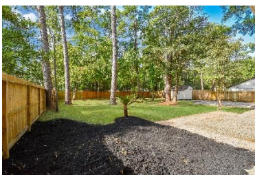
Large Back Yard