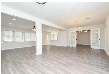
Foyer and Large Family Room