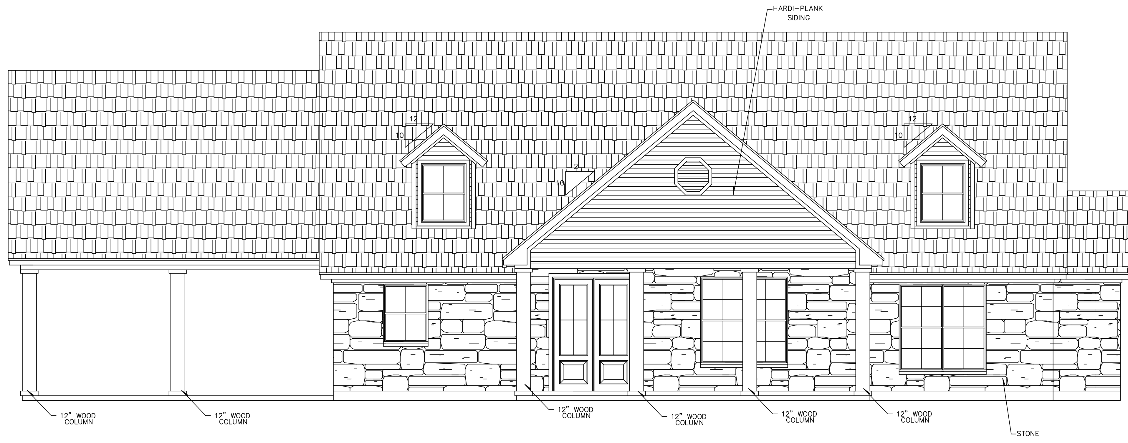
FRONT ELEVATION SCALE: 1/4" = 1'-0" CONTRACTOR SHALL VERIFY ALL DIMENSIONS, ENGINEERING, AND LOCAL BUILDING CODES ARE CORRECT PRIOR TO CONSTRUCTION.