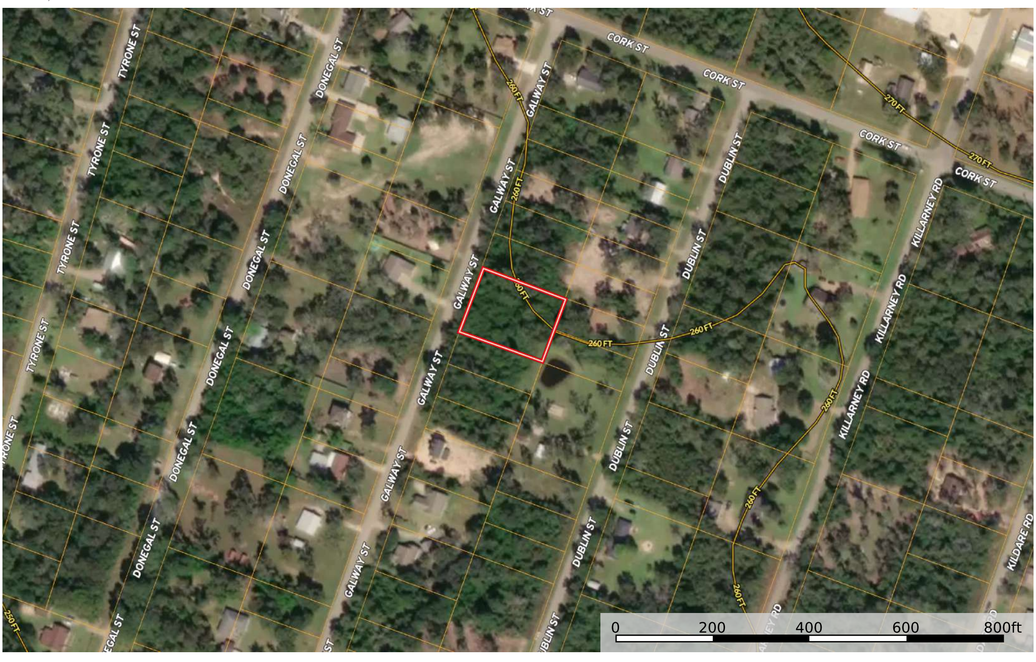
Texas, AC +/-