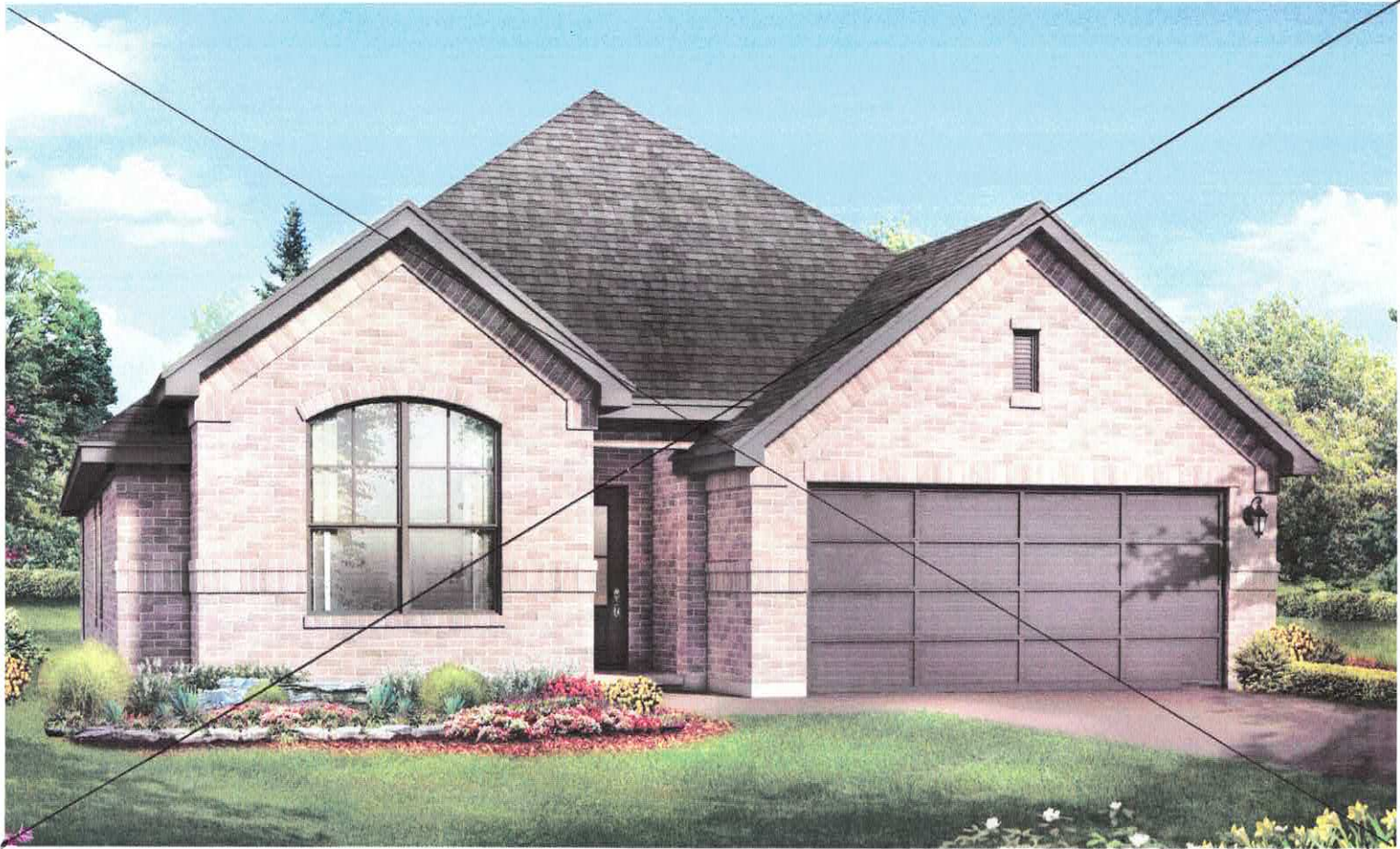
ELEVATION A - 2079 SQ.FT.