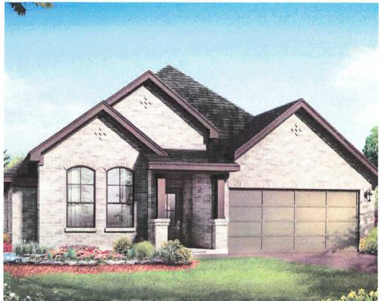
ELEVATION C - 2079 SQ.FT.