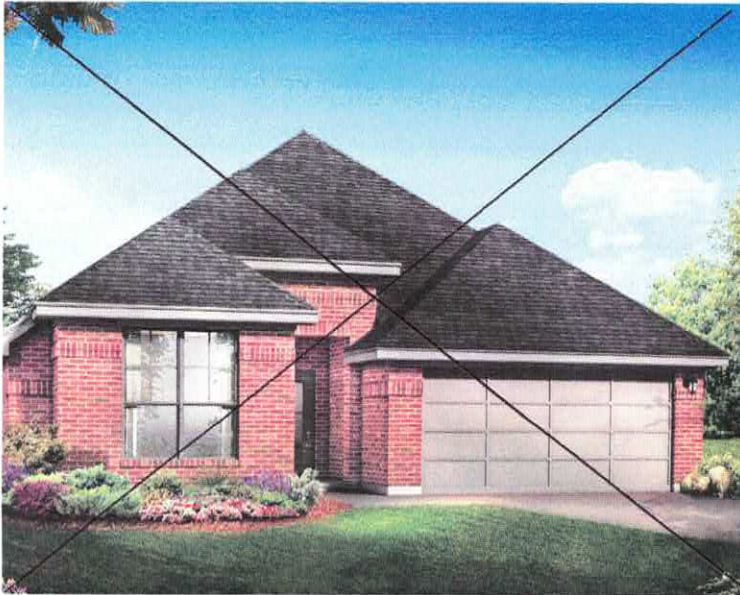
ELEVATION B - 2079 SQ.FT.