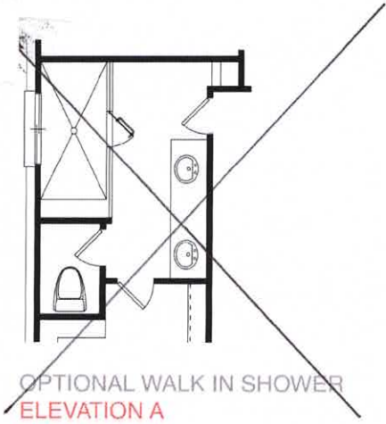
MAIN FLOOR ELEVATION A