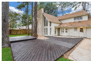
Back yard & deck