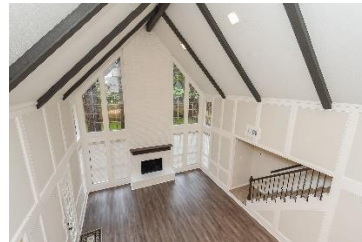
View of the Living Area from upstairs