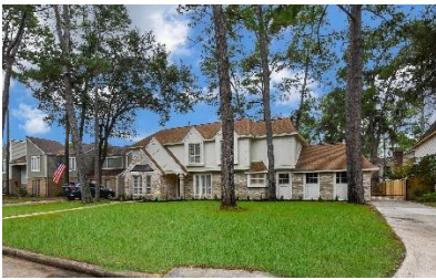
Mahogany Forest Drive