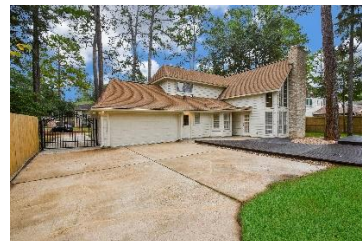
Another view of the back yard