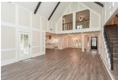
Another view of the Living Area