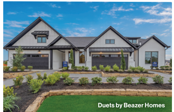
Duets by Beazer Homes

Two new product designs are now selling in Parkland Village. Bringing an urban feel, Chesmar Homes' Courtyard Collection features Modern Farmhouse designs with bright and open floorplans. The new collection features a sociable entry courtyard drive with decorative pavers. The Portrait Series by Newmark Homes was designed with the growing family in mind and offers floor plans that provide a spacious and flexible living space, which enhances social interaction, natural light and better flow.