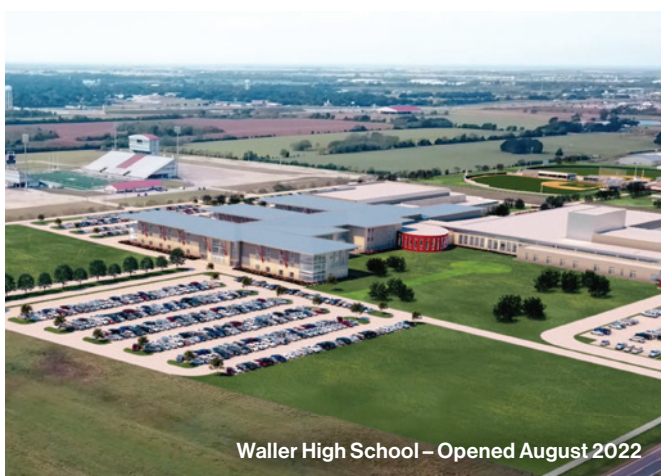
Waller High School – Opened August 2022

ONE OF THE TOP-RATED SCHOOL DISTRICTS IN THE STATE, WALLER ISD EARNED A "B" RATING OVERALL FROM THE TEXAS EDUCATION AGENCY IN THE LATEST STATEWIDE RATINGS