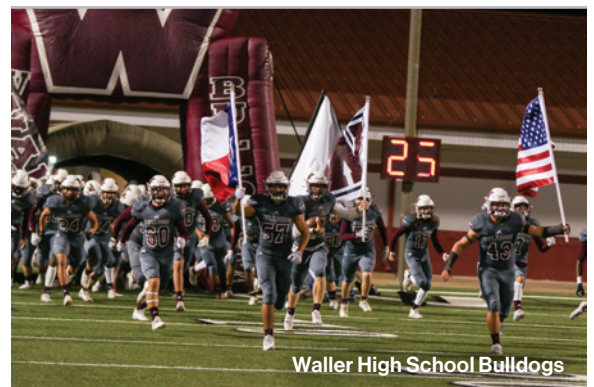
Waller High School Bulldogs