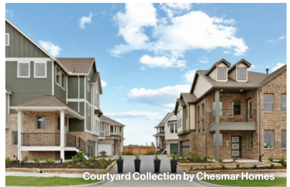
Courtyard Collection by Chesmar Homes

For more information, visit Bridgeland.com/ParklandVillage .