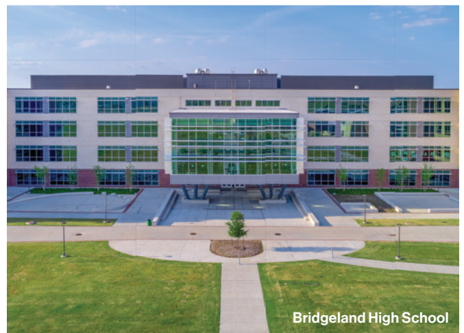
Bridgeland High School