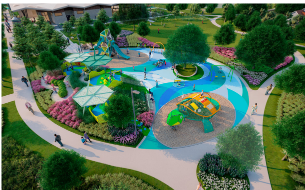
Creekland Amenity Center - Opening 2025

Nestled along Cypress Creek, Creekland Village is Bridgeland's exciting new addition where you and your family can experience the outdoors. Here, live in harmony with natural surroundings and the wonder of nature around every corner. With 3,000 homesites to choose from, you can enjoy easy access to walking trails, parks and ample outdoor spaces. At Creekland, located just west of Grand Parkway, you'll have access to all of Bridgeland's current amenities and a variety of new amenities that will be built in Creekland. In fact, 54% of Creekland is dedicated to greenspace, parks and trails.