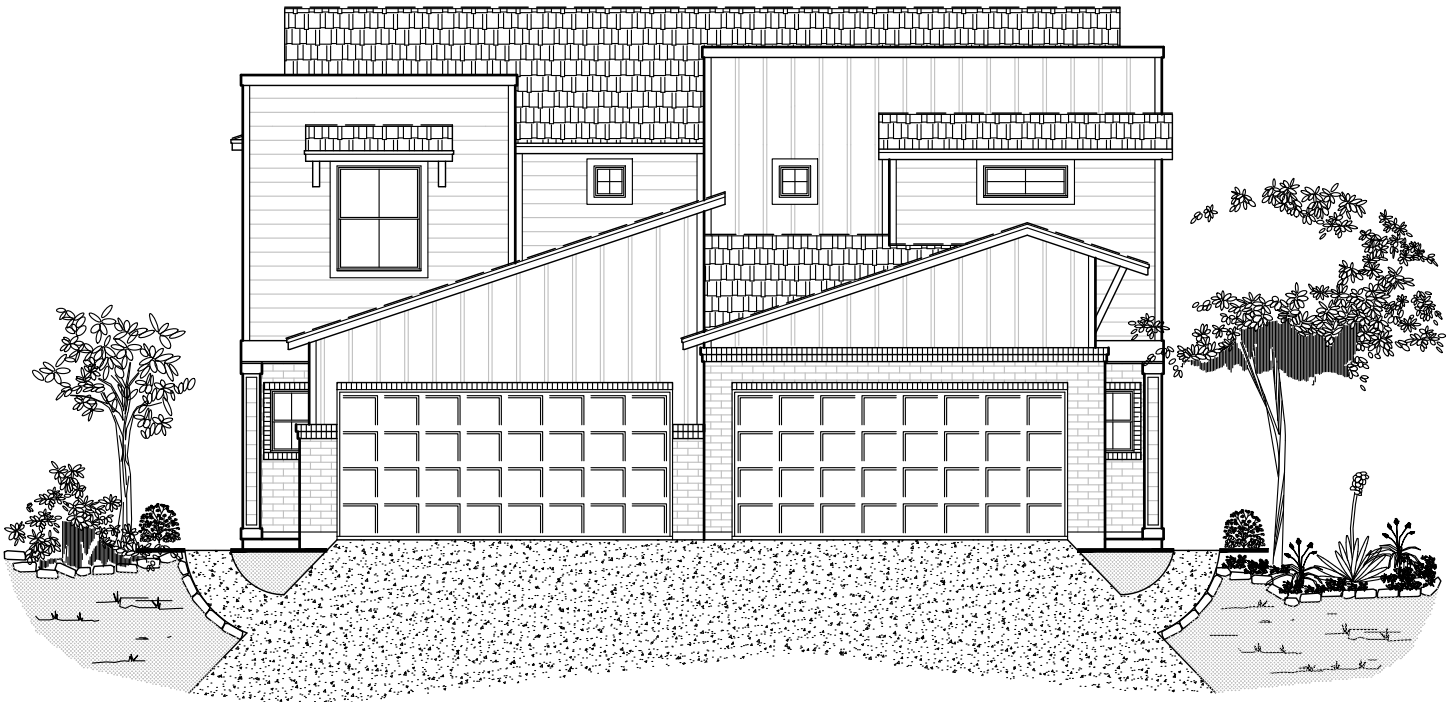
FRONT ELEVATION Plan 1580 'ELOISA'

Brochure plans are artist depictions and may vary from actual plan. Square footages, room dimensions, prices, specifications, materials, and availability of homes by community may vary, and are subject to change without notice.