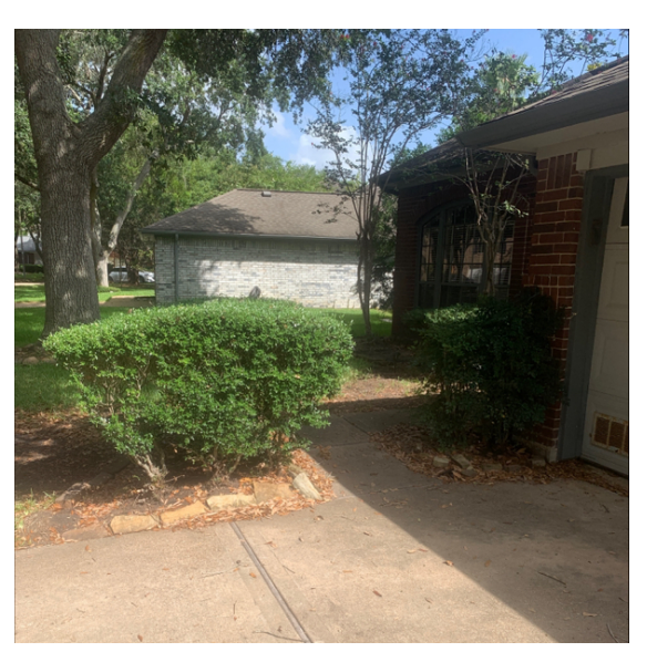
Other Treatment Photos Broadcast granular baits in flower bed area for ants and other insects