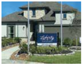
Liberty Home Builders