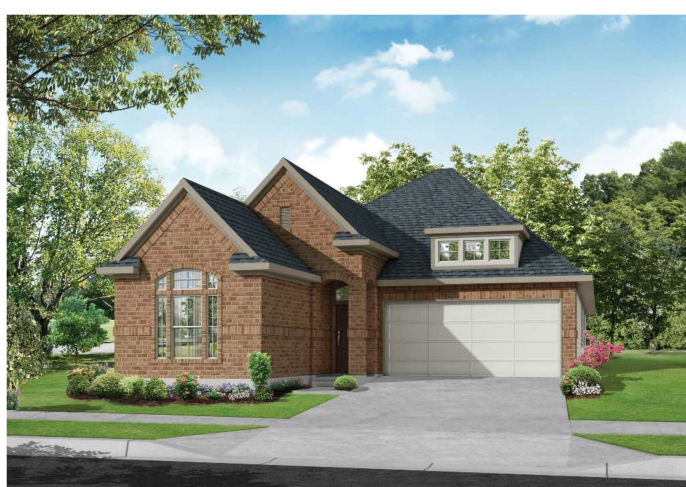
ELEVATION A left