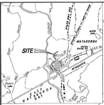
VICINITY MAP SCALE: N.T.S.