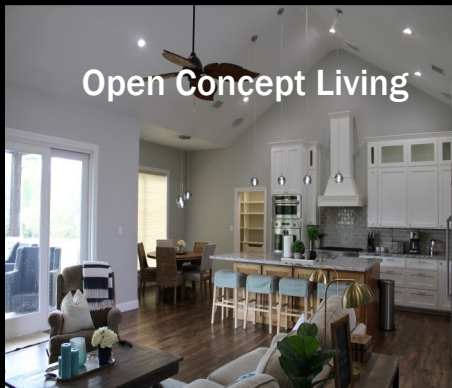
Open Concept Living