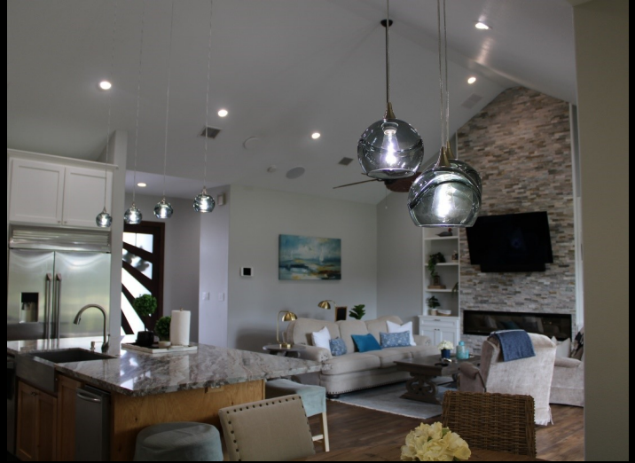
Large living with vaulted ceilings.