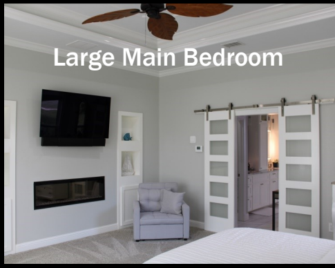
Large Main Bedroom