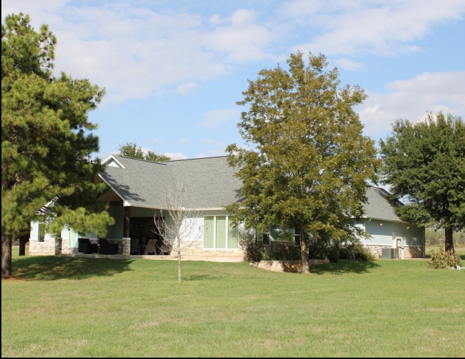
2 or 3 BR/2.5 Bath Home