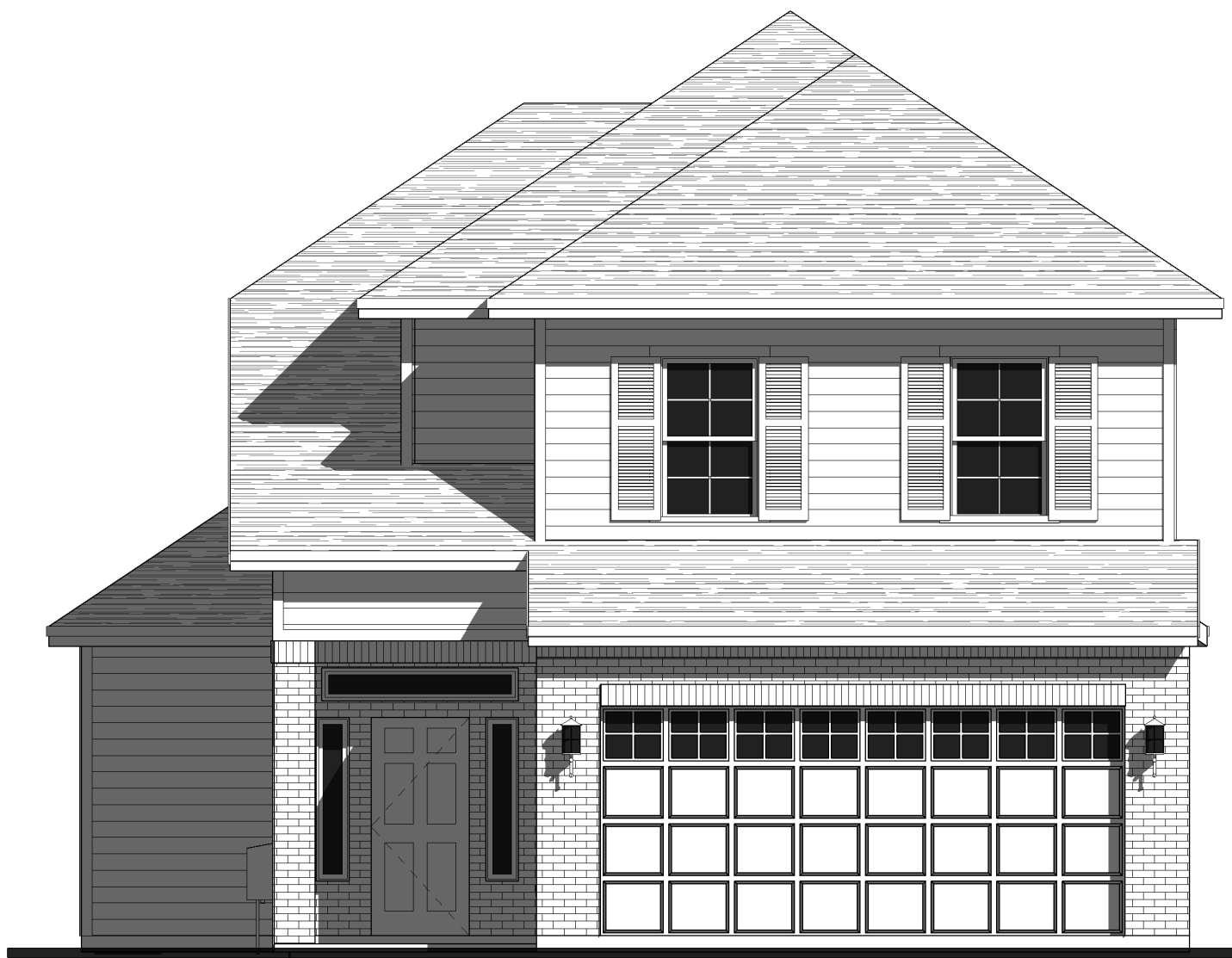
① FRONT ELEVATION-BROCHURE